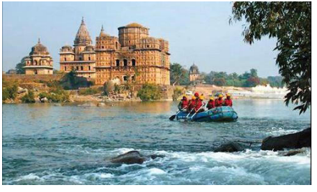
River Rafting in Orchha