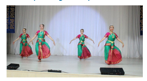
Indian Dance Group "Surmnath Kalbeliya" Performs Rajasthani Folk Dances in Astana