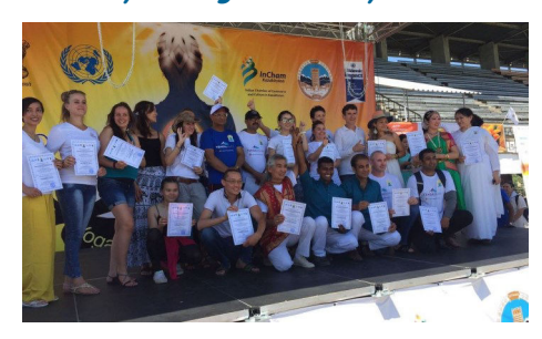
Celebration of the 3rd International Day of Yoga in Karaganda